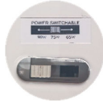
Wattage Selectable Switch