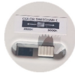
CCT Selectable Switch