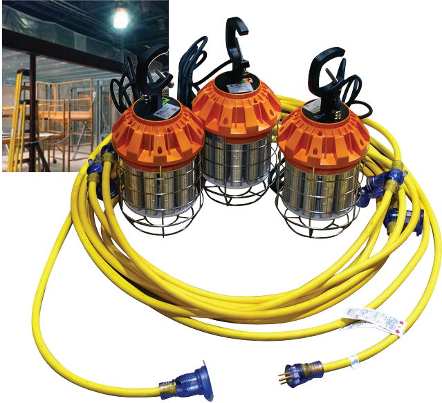
K3 kit contains three (3) Temporary Working Lights and one (1) 50FT Stringer.