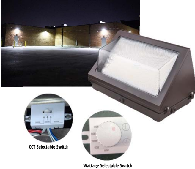
CCT Selectable Switch