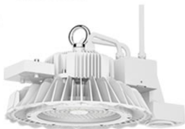
S1/S2 Factory Installed Sensor