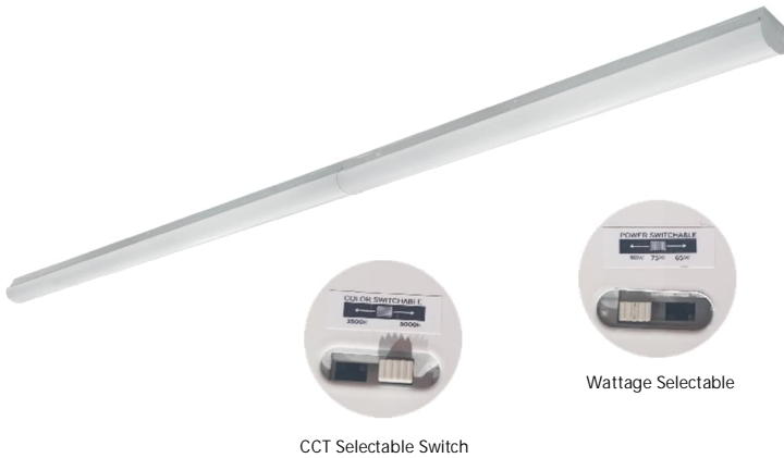
CCT Selectable Switch