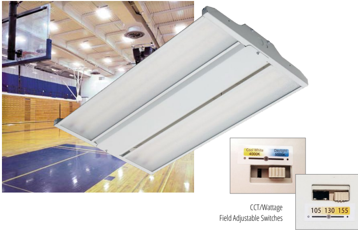
CCT/Wattage Field Adjustable Switches