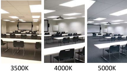
3500K 4000K 5000K