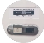
Wattage Selectable Switch