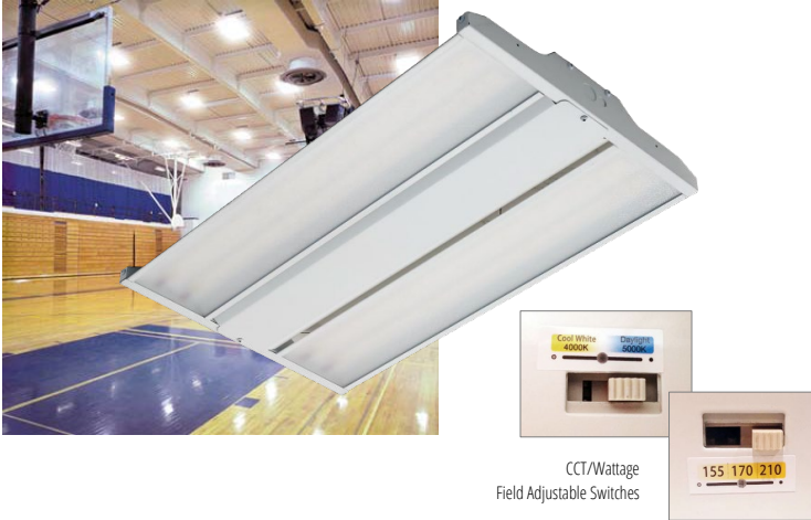
CCT/Wattage Field Adjustable Switches