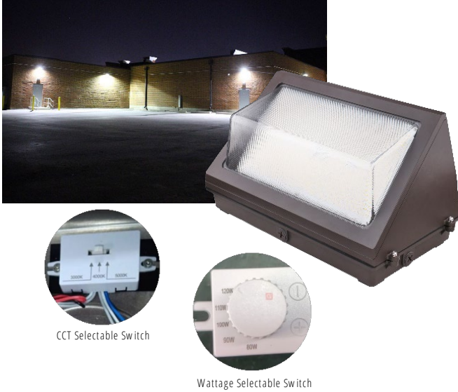
CCT Selectable Switch