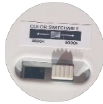
CCT Selectable Switch