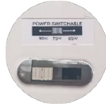
Wattage Selectable Switch